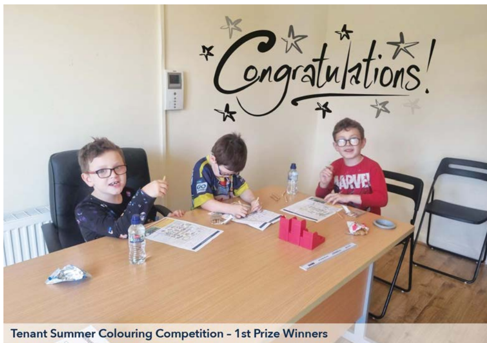
Tenant Summer Colouring Competition - 1st Prize Winners

Huge congratulations to our winners of the Summer Colouring Competition.