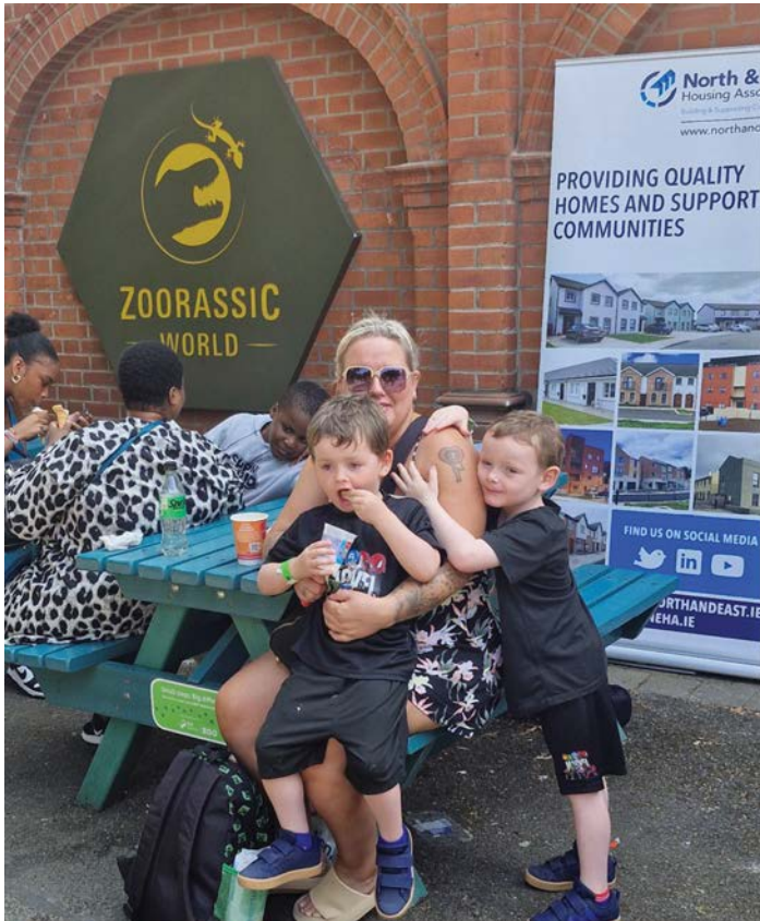
Family Fun Day - Dublin Zoo