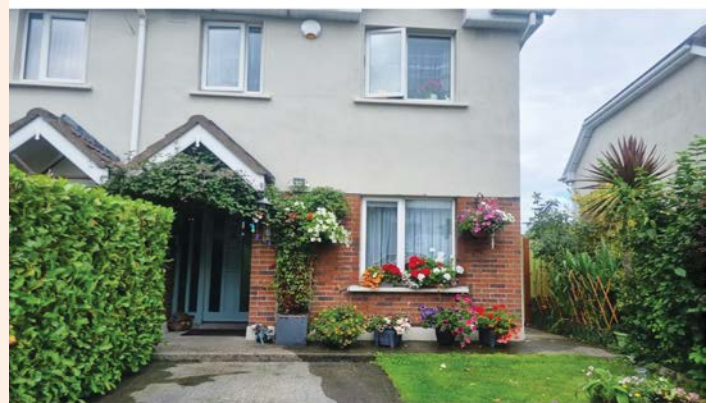
Tenant Meet and Greet - Blackthorn Grove