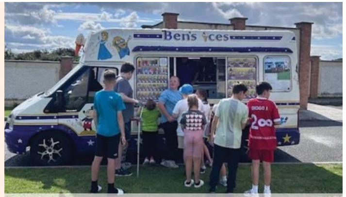
Tenant Event - Ardmore

We were delighted to meet and greet the lovely tenants in Blackthorn Grove, it gave everyone a wonderful opportunity to get to know each other, meet the management team, and learn more about the services and activities available. It was an engaging and friendly experience for us and all tenants we met received a token of appreciation from us.