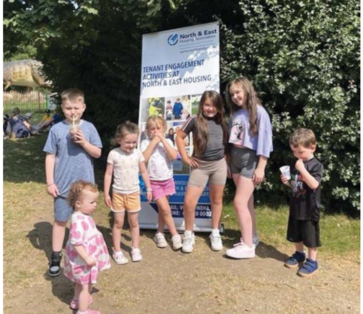
Family Fun Day - Dublin Zoo

Is there something you would like to do in your community on or outside your estate? Please let us know at voice@neha.ie and we will follow up with you.