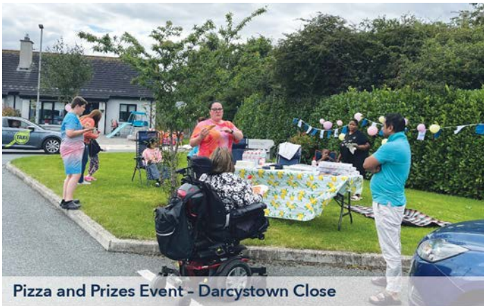
Pizza and Prizes Event - Darcystown Close