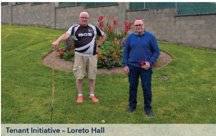
Tenant Initiative - Loreto Hall